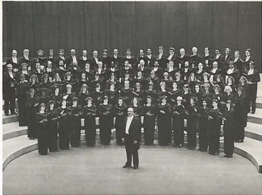
The Los Angeles Master Chorale

During its 1992-93 season at the Dorothy Chandler Pavilion the Chorale will present ten concerts. Highlights will include the world premiere of Cantares Argentinos by Lalo Schifrin, commissioned by the Master Chorale, and the Los Angeles premiere of Te Deum by Dominick Argento. During the 1992-93 season, the Chorale will also make several appearances with the Los Angeles Philharmonic and will serve as the chorus in the Los Angeles Music Center Opera productions of Tosca and Lucia