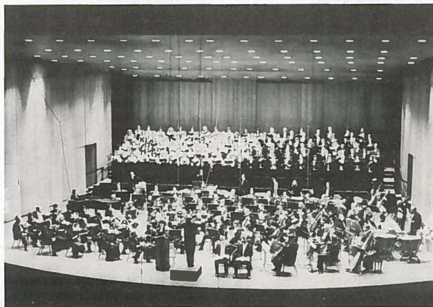
Los Angeles Master Chorale and Sinfonia