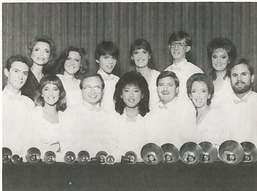
Pacific Handbell Ensemble

Conductor Roger Wagner founded the Master Chorale in 1964 with the support