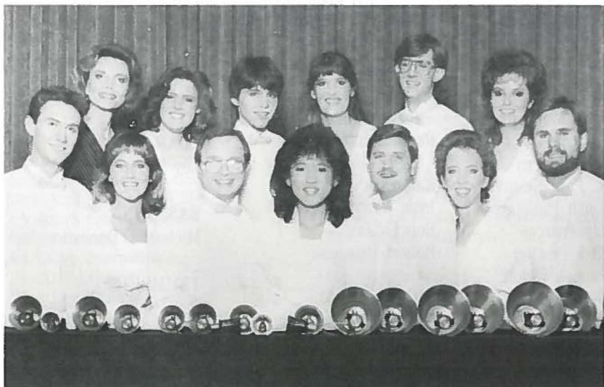
Pacific Handbell Ensemble

States, 1984, 1986 & 1988, Opening Concert, Edinburgh Harp Festival International, 1987, Third World Harp Congress, Vienna, Austria, 1987 and Rochas Festival of the Harp, Paraguay, 1988.